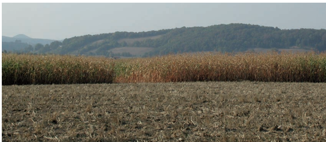
Figure 2: Corn field showing drought damage 2003

Given the presented trend, the question of insurance cover for damage in animal farming and fodder production, and of financing damage redress as a result of heavy precipitation, hail and drought also becomes increasingly pressing. The question of whether agriculture itself, governmental or other sources will cover the costs involved remains open.