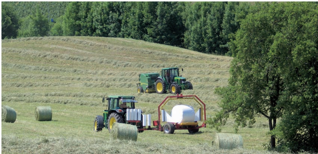
Figure 5: In the harvesting of round bale silage, additional harvesting possibilities in early and late summer arise due to global warming. Expensive special machines may therefore be better used to capacity.

It would be particularly useful in practice to have a seasonal forecast at hand for annual planning. This would support farm management, which will need to have a broader palette of measures available in the event that climate is more strongly influenced by extreme events.