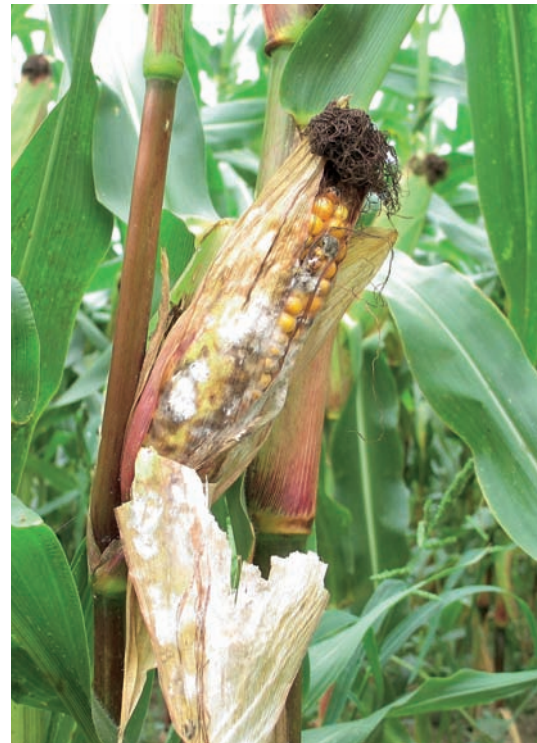
Figure 4: Infestation of a corn cob by toxic fusarium fungi. The occurrence of fusaria is caused through injury of the corn by insects, hail and growth cracks. It is enhanced by strongly changing climatic conditions.

Due to the complex interactions between pests, beneficial organisms, host plants and cultivation methods, as well as the different effects of abiotic factors, such as heat, CO 2 and O 3 , predictions regarding long-term trends are difficult. The only thing that is certain is that climate change will force us to face new problems at increasingly shorter intervals. Simplified crop rotation and focus on a small number of cultivated plant species also encourages problems with pests.